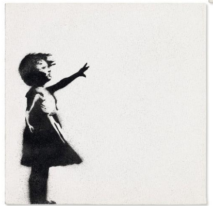
Banksy, Girl with Balloon (Diptych) (2005, estimate: £2,500,000-3,500,000)

LONDON – Unveiled in London on 1 October, Banksy's Girl with Balloon (Diptych) (2005, estimate: £2,500,000-3,500,000) will highlight Christie's 20th / 21st Century: Evening Sale Including Thinking Italian, London on 15 October 2021. A poignant two-part version of what is perhaps Banksy's most iconic image, Girl with Balloon (Diptych) is a vision of innocence and hope. The work consists of two canvases, each on an intimate 30 x 30 cm scale. In one stands a small girl, stencilled in black against the white background, with her hand upraised; in the other, a red, heart-shaped balloon drifts away into the sky. Created in 2005, one year after the Girl with Balloon motif appeared on London's South Bank,